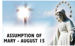
ASSUMPTION OF MARY - AUGUST 15