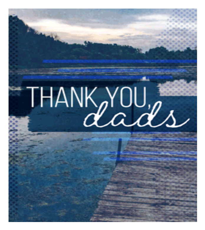
HAPPY FATHER'S DAY -- JUNE 16TH